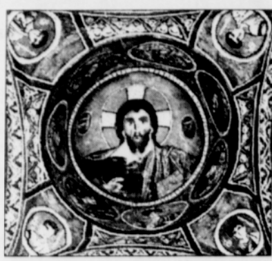
Frescoes of early Christian teachings, The Dark Church, Goreme.

• In the Cappadocia region Christians built complete underground cities to escape persecution during the seventh century.