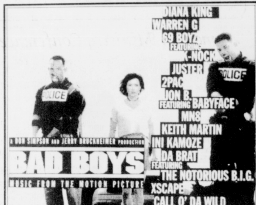
A collection of rhythm and blues and hip-hop songs are featured in Bad Boys , a heart-stopping action comedy from Columbia Pictures.