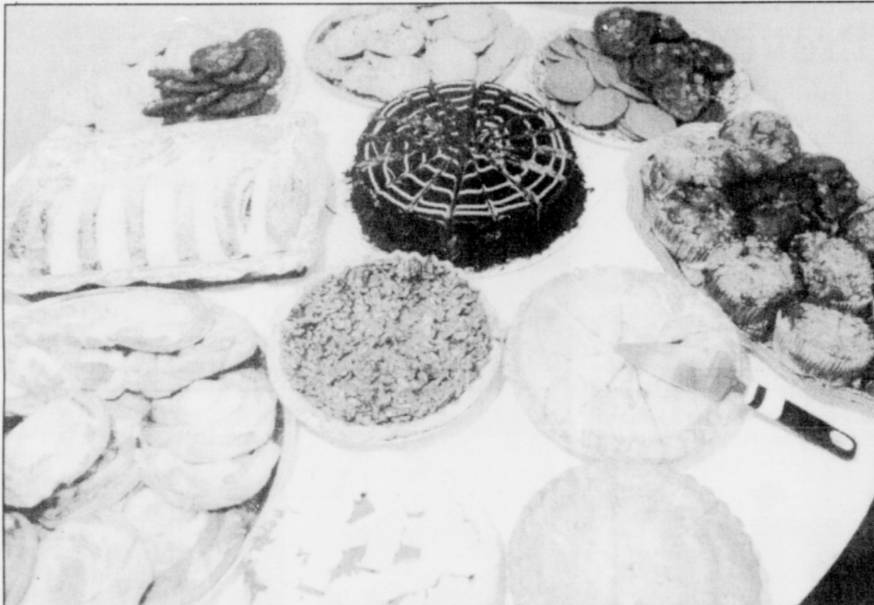
Oooh So Good! Workers at the Albina branch of Oregon Adult and Family Services went all out recently to prepare a special luncheon to celebrate Cultural Awareness Day and Black History Month.