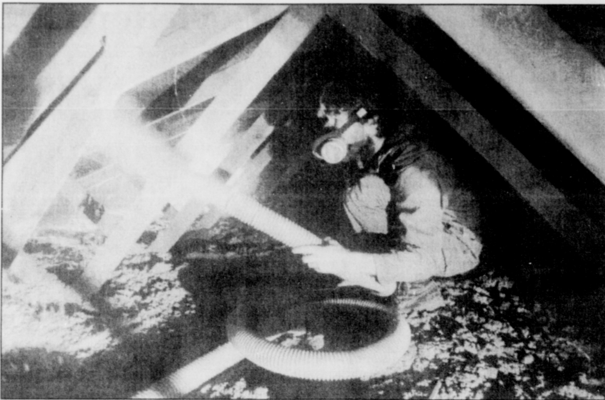
A worker installs insulation in a northeast Portland home as part of a weatherization program by Pacific Power.

Under the program, homes received energy-efficiency measures such as ceiling and floor insulation, door weatherstripping, thermostats, water heater and pipe insulation, energy saving showerheads and faucet aerators.