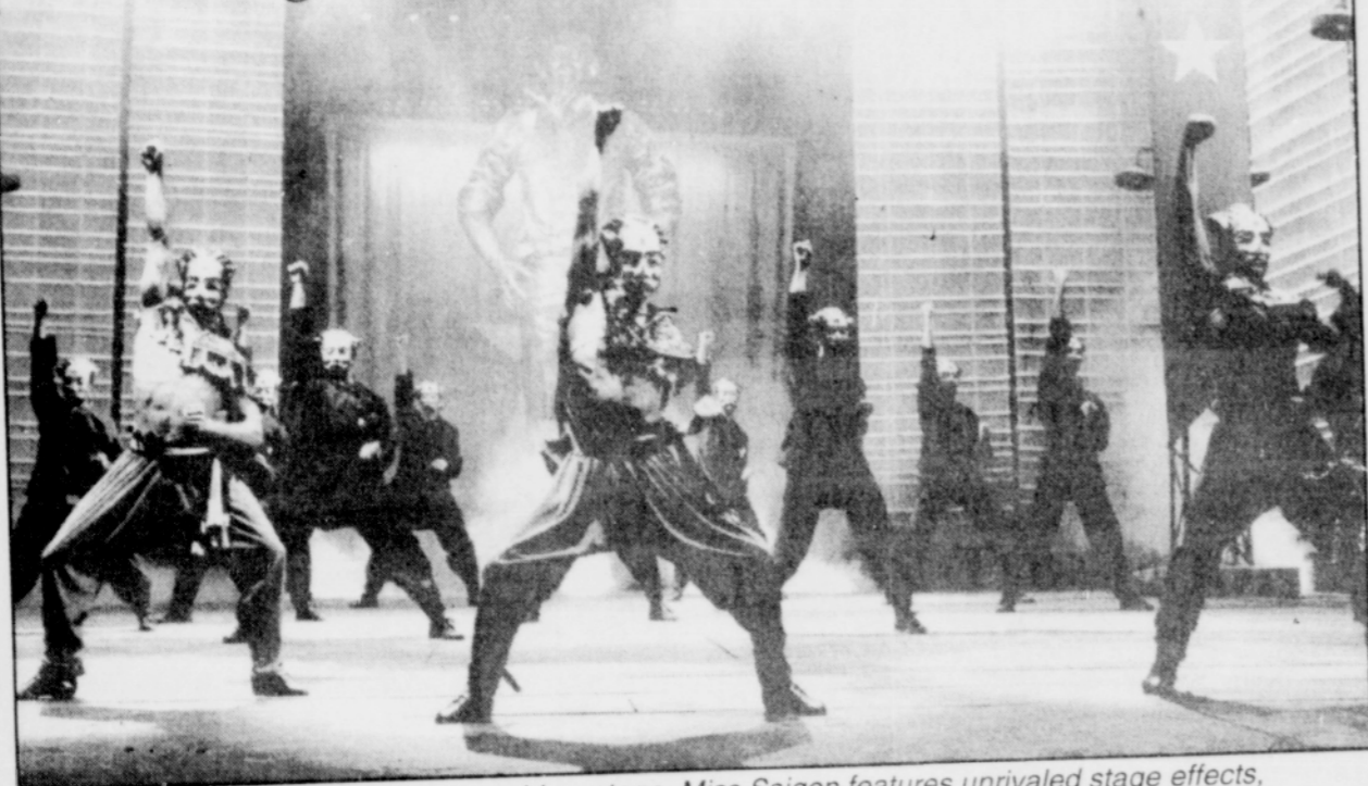
One of the most poignant tales ever told on stage, Miss Saigon features unrivaled stage effects, including a nearly full-sized helicopter.

Miss Saigon, the eagerly awaited blockbuster musical, kicks off Portland's Broadway theater Season in spectacular fashion.