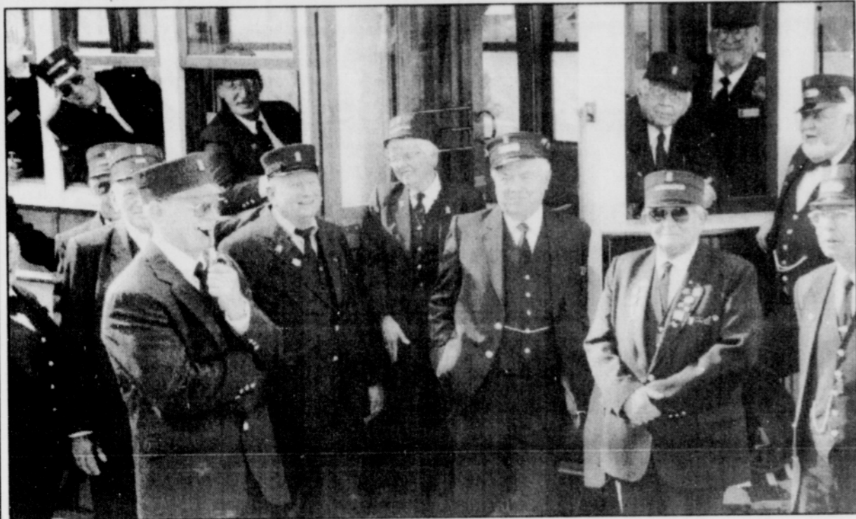
Vintage Trolley conductors, including three of the original motormen from the 1940s, celebrate the Portland trolley's history and its sponsors. The trolley's free weekend service began this month and resumes daily service in June.