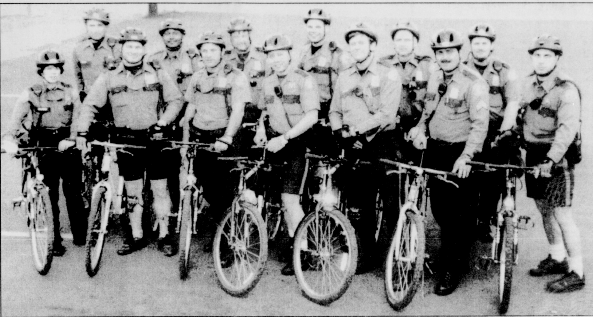
Portland Police make a stop at the Portland Observer, 4747 N.E. Martin Luther King Jr. Blvd., after finishing a training session for bicycle patrols at the nearby Northeast Precinct.

Hundreds of blacks and other supporters of civil rights recently commemorated the historic Selma to Montgomery March with a reenactment.