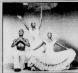
See Entertainment, page B3.

The Alvin Ailey dancers perform at Portland's Schnitzer Hall.