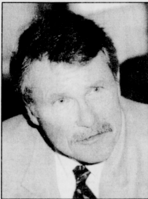
Gov. John Kitzhaber

"Quite frankly, I'm upset with the tone of the criticism, which is inappropriate,"