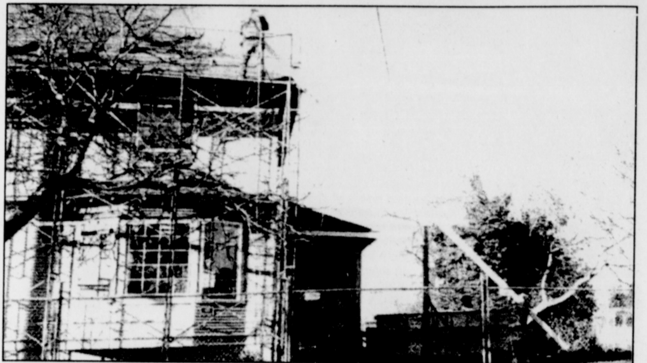
A task for two good men: to get an extra-long gutter up to the second-story roof level. Ken and Bruce can handle it.

"This is the Lord's doing, and it is marvelous in our eyes."