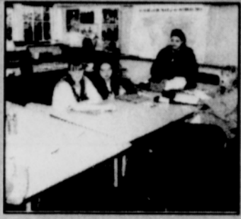
See Metro, inside.

A team of pregnant and parenting students prepare to compete in high school academic tournament.