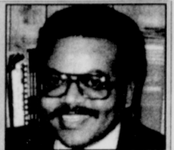
See Black History, page B6.