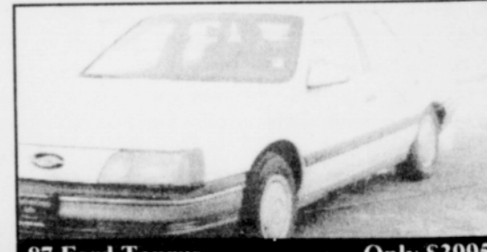
87 Ford Taurus Only $3995