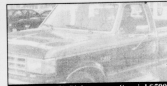
88 Ford F-150 Pickup Special $5995