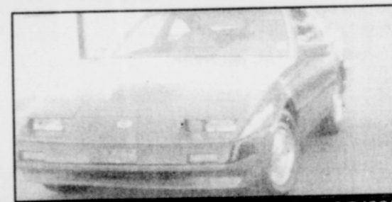
84 Nissan 300ZX Reduced $4995