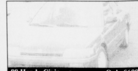
88 Honda Civic Only $6995