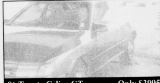
86 Toyota Celica GT Only $3995