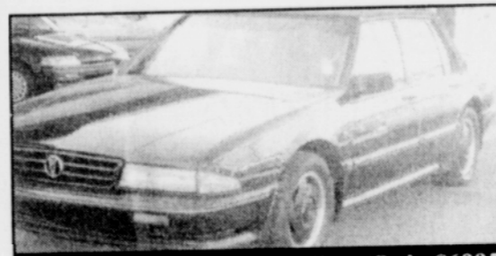
89 Pontiac Bonneville SSE Only $6995