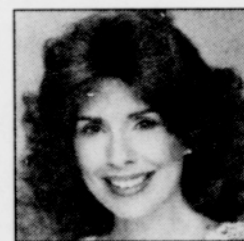
June 5-5:30 pm