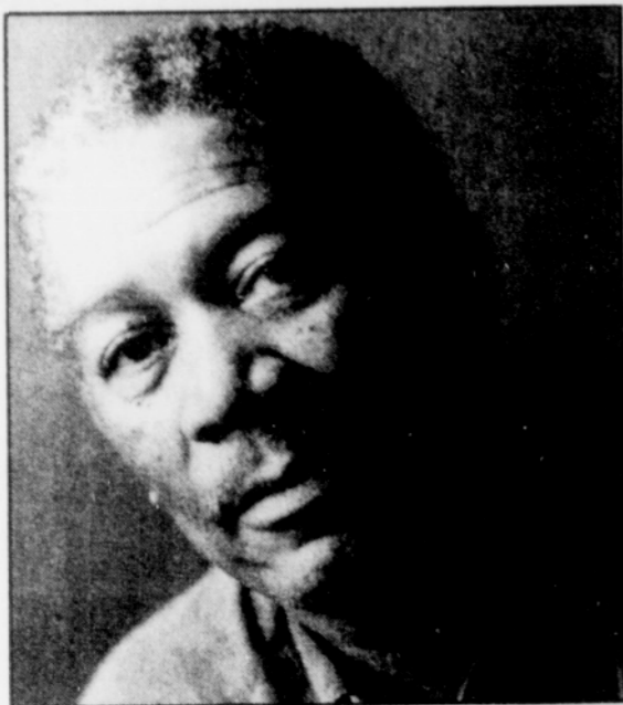
Actor Morgan Freeman narrates The Promised Land

Between 1940 and 1970, more than five million Americans journeyed from the rural South to the urban North in search of new jobs, new freedom and new lives. It was the greatest peacetime migration in the nation's history, the largest peacetime migration of any people in the world, and it literally transformed American politics and popular culture. Yet 25 years later, few people know it happened, or understand how its importance affects all Americans today.