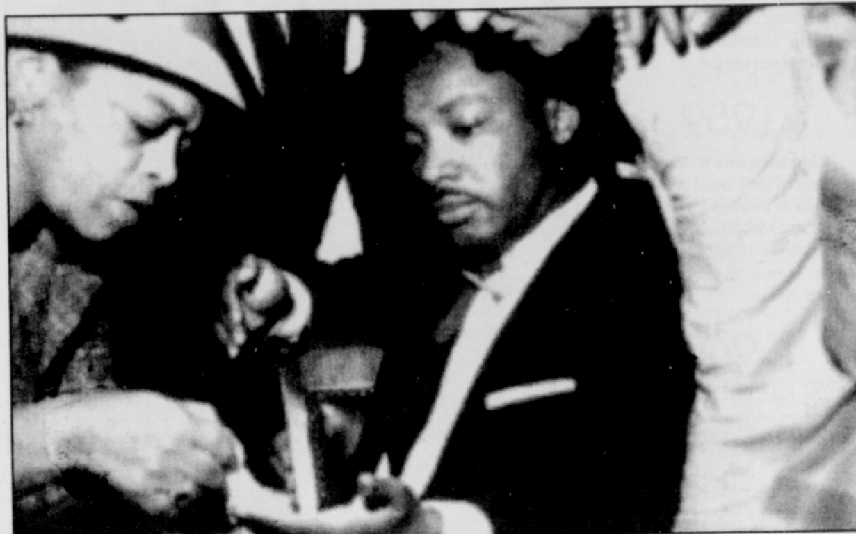
King waits for an ambulance moments after a deranged woman stabbed him with a letter opener at a New York store in Sept. 1958. He later referred to this incident in his speeches whenever he was preoccupied with death.

The first day of the bus boycott. The trial for Mrs. Parks. A meeting of movement leaders is held. Dr. King is unanimously elected president of an organization named the Montgomery Improvement Association, a name proposed by Reverend Ralph