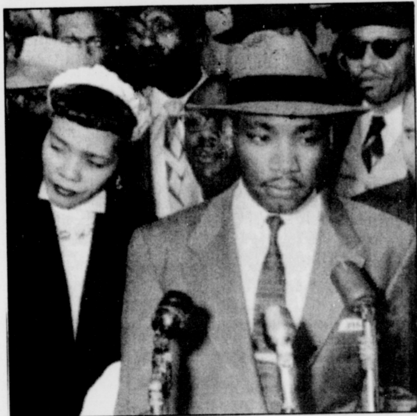
King and his wife, Coretta, meet with reporters on the steps of the Montgomery County Courthouse before his trial in March 1956 for violating a state law forbidding boycotts.