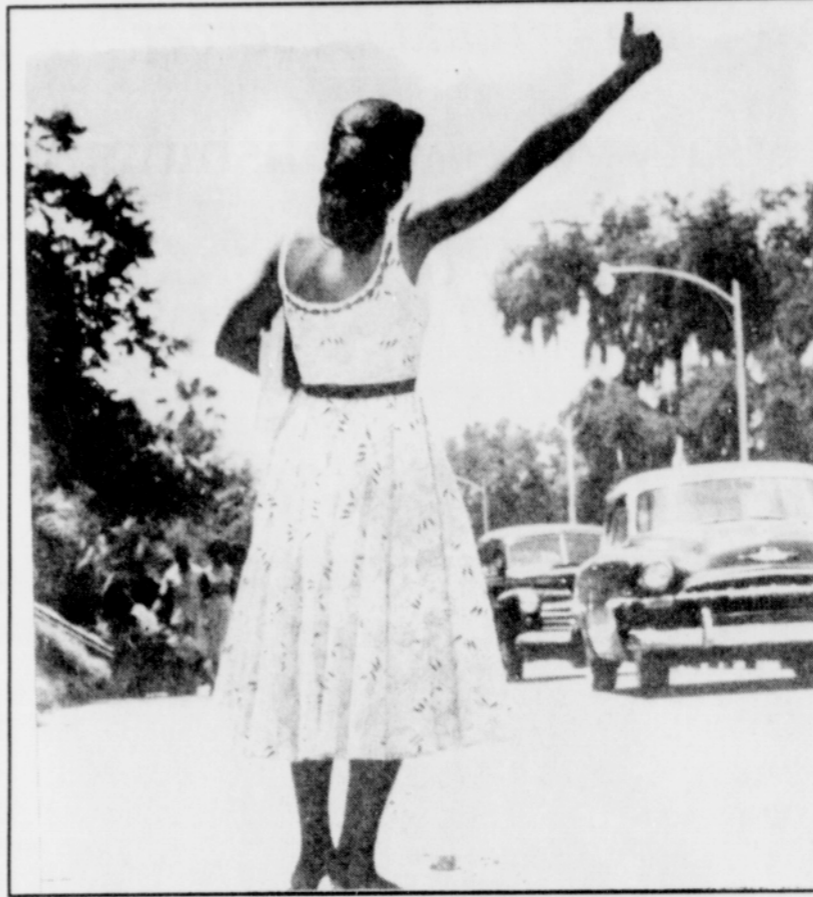
The Montgomery bus boycott succeeded because black women who depended on the buses for transportation refused to ride until they were granted fair seating. For more than a year, they took taxis, carpooled, walked and hitchhiked.

"We are prone to judge success by the index of our salaries or the size of our automobiles, rather than by the quality of our service and relationship to humanity."