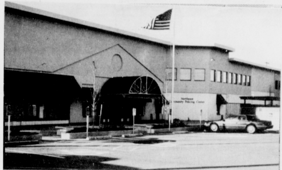
Northeast Community Policing Center

In celebration of Dr. Martin Luther King, Jr.'s birthday the Portland Police Bureau wishes to thank the citizens of Portland for your assistance and cooperation in our transition to community policing.