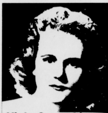
Viola Gregg Liuzzo 1925-1965

Killed by Klan While Transporting Marchers, Selma Highway, Alabama