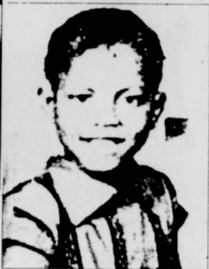
Addie Mae Collins 1949 - 1963

Schoolgirls Killed In Bombing Of 16th Street Baptist Church, Birmingham, Ala.