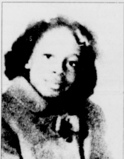
Denise McNair 1951 - 1963