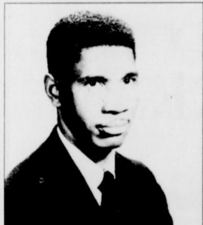
Medgar Evers 1925 - 1963

"In Jackson, Mississippi in 1963, there lived a man who was brave. He fought for freedom all of his life. But they laid Medgar Evers in his grave." - Bob Dylan, "The Ballad of Medgar Evers"