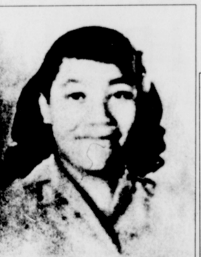
Carole Robertson 1949 - 1963

Youth Killed During wave of Racist Violence, Birmingham, Ala.