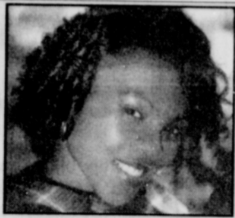
See Sports, page B2.