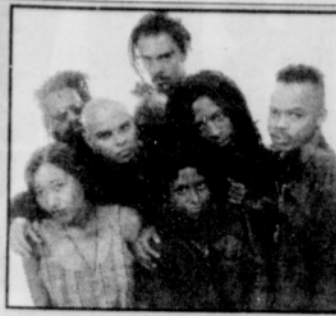
See Entertainment, page B3.

The latest works by Spearhead puts forth music based in social consciousness and influences from African ancestors.