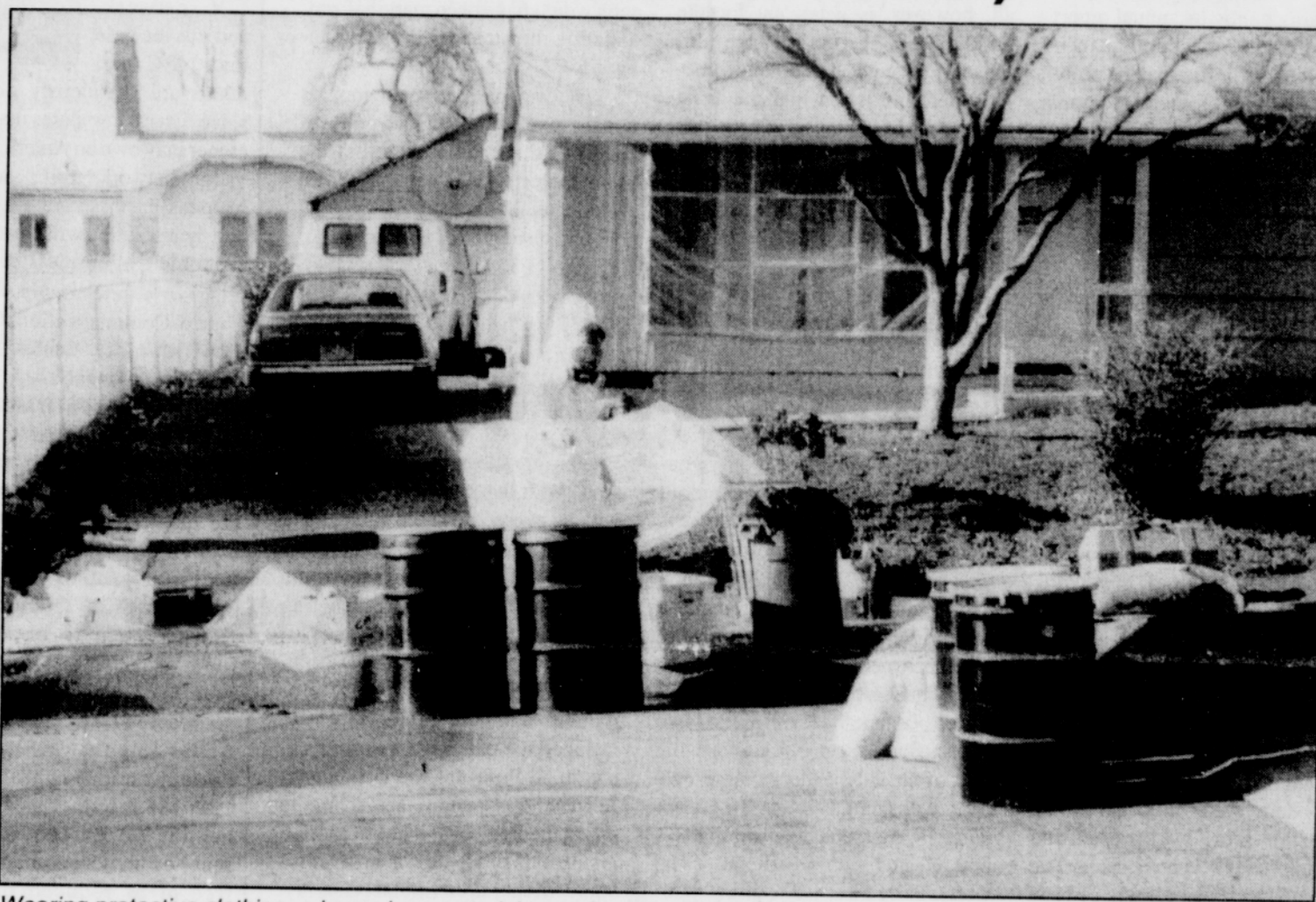
Wearing protective clothing, a hazardous material team from the Portland Fire Bureau, sorts through chemicals suspected of being used to produce methamphetamine, seized from a house at 4329 N.E. Garfield Ave.

Portland police said chemicals were cooking on the stove when they carried out a search warrant on a suspected methamphetamine lab in a northeast Portland home.