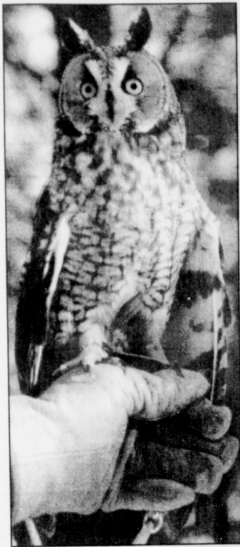
Leon, a long-eared owl, is one of the stars in The High Desert Museum's birds-of-prey presentations.