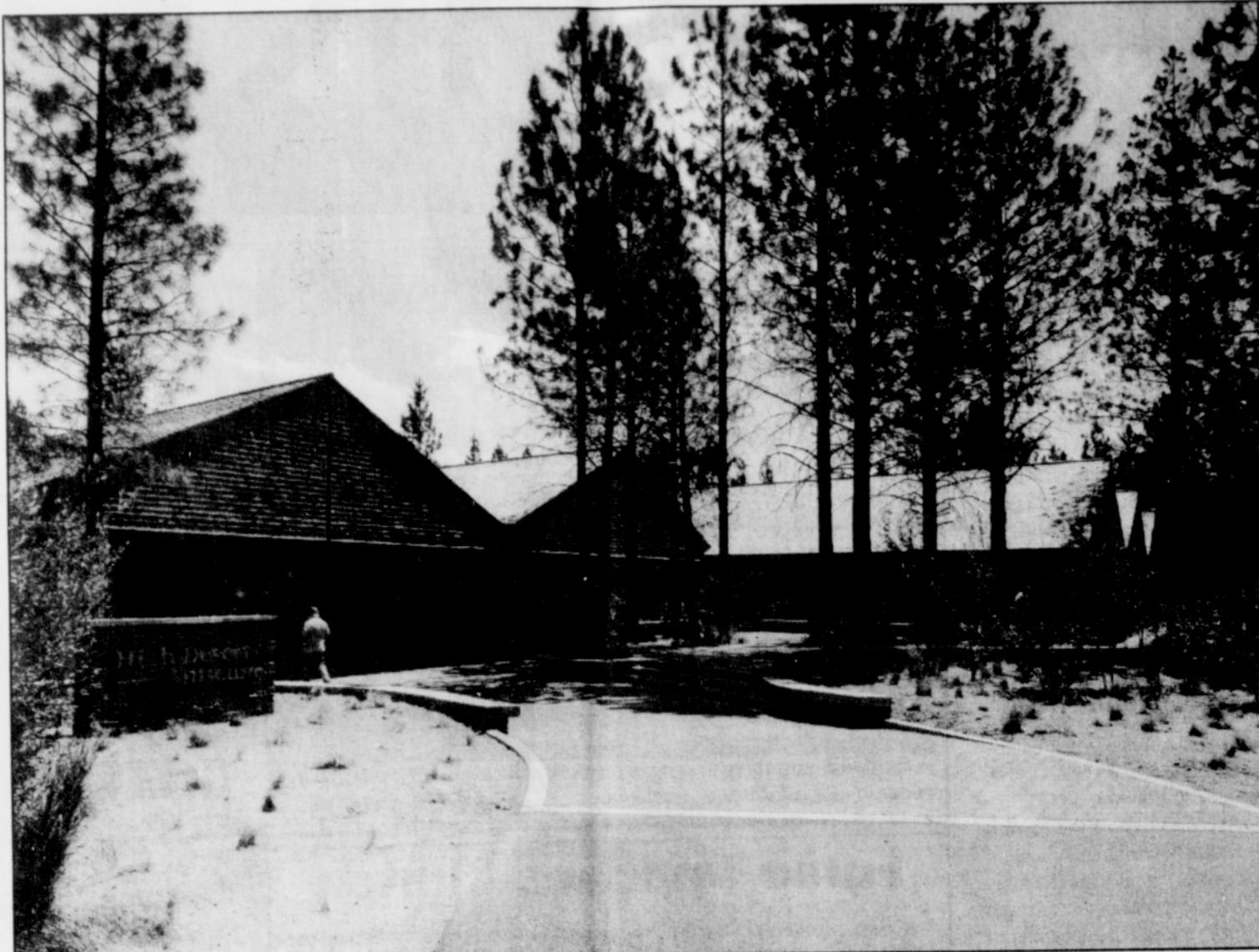
The High Desert Museum near Bend on the edge of the Deschutes National Forest is open every day except Christmas, New Year's and Thanksgiving.