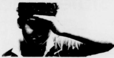
DONN THOMAS PHOTOGRAPHY

"This is a photo of my son. I choose it for my logo because it captures a precious moment. When you have a moment to capture, I hope you'll call."