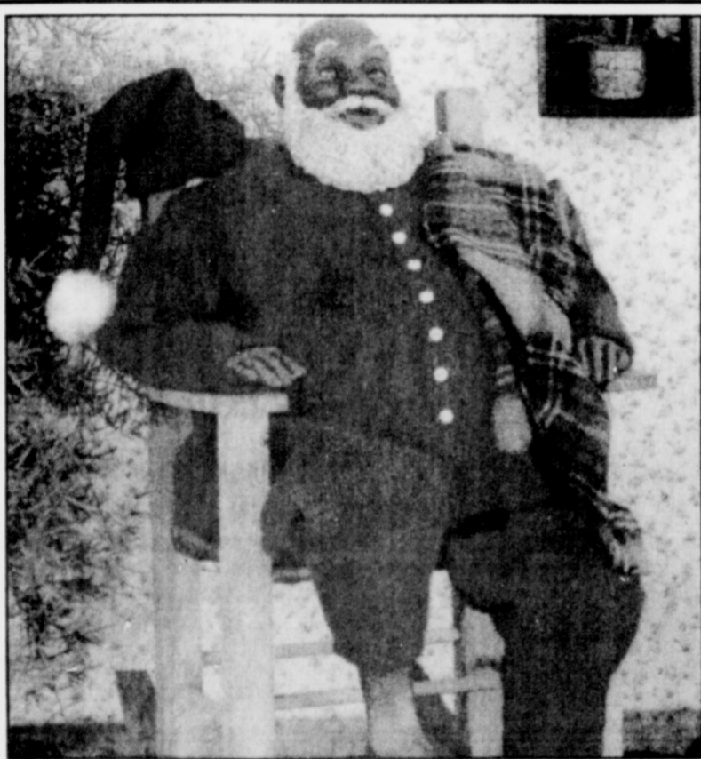
DADDY'S LONG LEG COLLECTOR'S DOLLS - 1994 SANTA

Presented by Delta Sigma Theta Sorority Inc. Proceeds go to the Delta Sigma Theta Scholarship fund.