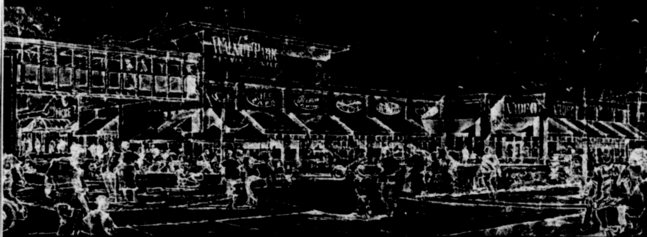
On the corner of N.E. Martin Luther King, Jr. Blvd. & Killingsworth St.