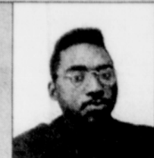
By Promise King

Anyway, take my message to those folks at Portland Association of Black Journalists. Couldn't even tell them I was going out of town. That is not cool.