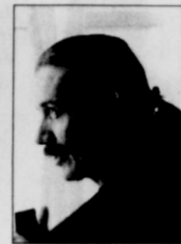
Famous personalities such as Tony Bennett, left, Lauren Hutton, and Edward James Olmos, right, are speaking out for the King holiday.