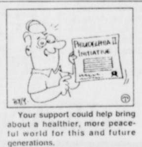
Your support could help bring about a healthier, more peaceful world for this and future generations.

The Ahmadiyya movement, a dynamic missionary sect in Islam, was founded by Hazrat Mirza Ghulam Ahmad of Qadian, India in March 1889. The Ahmadiyya Muslim Community has built Mosques and missions throughout the world and is actively engaged in educational and welfare activities. The Ahmadiyya movement in Islam is now established in 145 countries of the world.