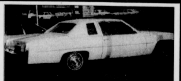
1978 White Cadillac Coupe de Villa - $2988

Riviera Motors • 333 SE 82nd • Portland • 252-2438