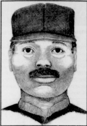
Sketch of armed robbery suspect

Portland Police Bureau Detectives, in cooperation with Crime Stoppers, are asking for your help in identifying and apprehending the suspect in an armed robbery.