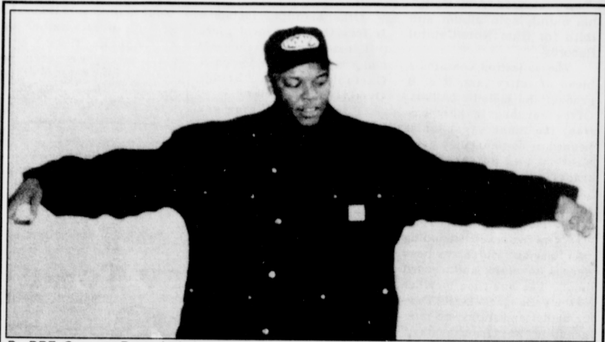
Dr. Dre, Concrete Roots Anthology