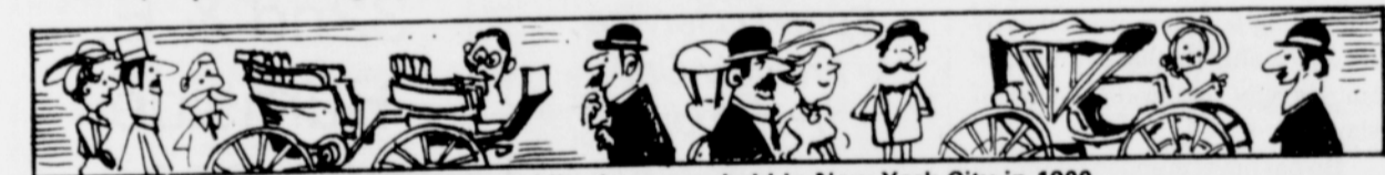
The first automobile show was held in New York City in 1900.

Call (503) 288-0033 or Fax (503) 288-0015 to place a Career or Classified ad in The Portland Observer.