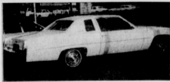
1978 White Cadillac Coupe de Villa - $2988

Riviera Motors • 333 SE 82nd • Portland • 252-2438