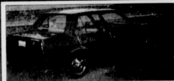
1986 Toyota Corolla - $4488

1-A valid driver's liscense; 2-A Job; 3-Insurance; 4-At least $200 down We Have A Car For You!