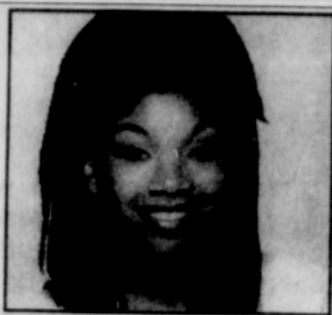
See Arts & Entertainment, Page B3