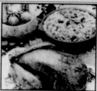
See Food, Page A6

Santa Fe Roast Turkey The new Southwestern Cuisine