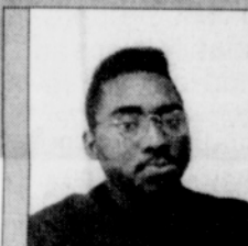
By Promise King

As winter's horrid cold takes hold of this part of the world, I am sure many of you are thinking of jetting out to the warm embrace of the Caribbean islands. But wait a minute, why not Africa? Tell me where in the world would you go for a real vacation if not Africa, especially when you are of Africa descent.