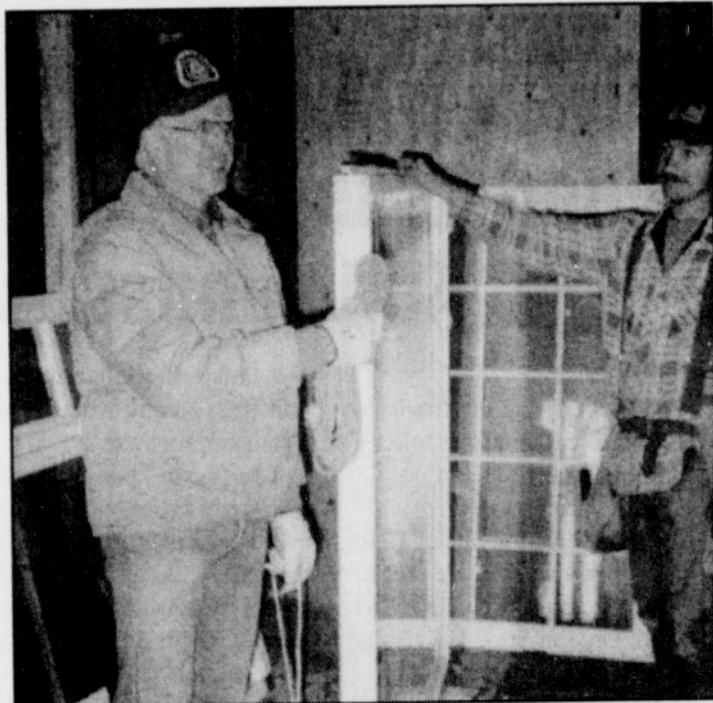
Workers show some of the new windows to be used in construction project.