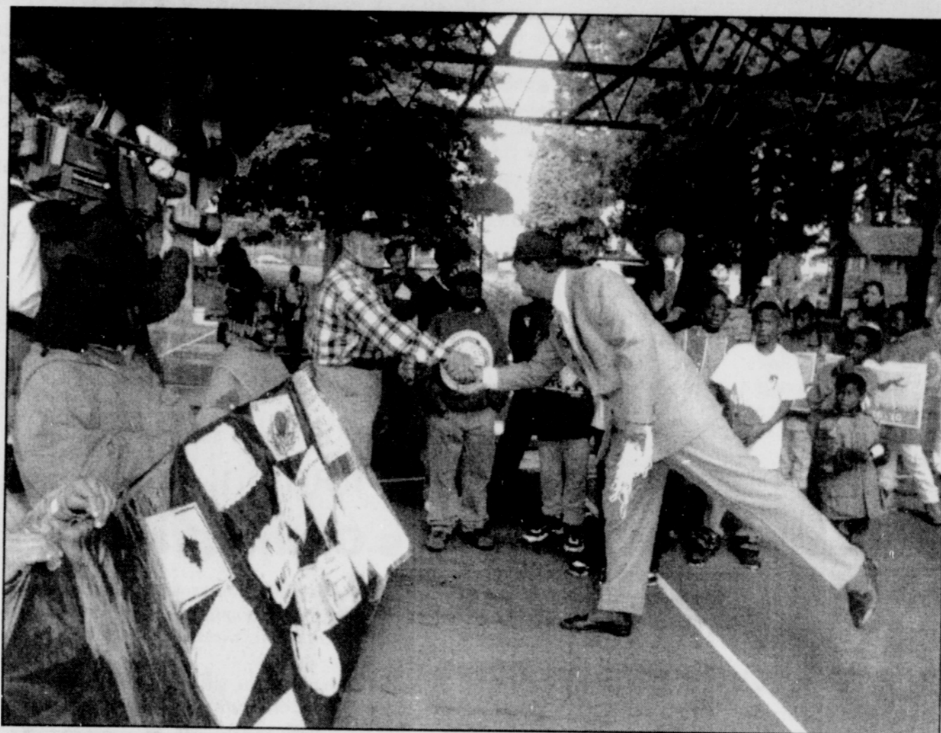
The Trail Blazers and Portland Parks and Recreation Bureau have teamed together to build and rehabilitate several public outdoor basketball courts, including the court at Alberta Park (above) which was recently resurfaced and restriped.