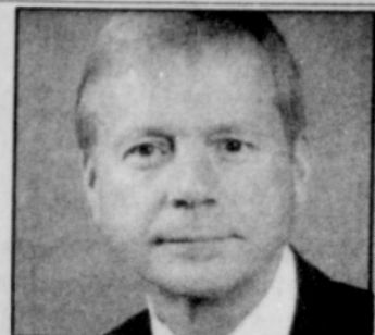
See page A7.