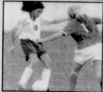
See Sports, page B3.

The Cardinal beats Wilson to move to the next round in the soccer city championships.