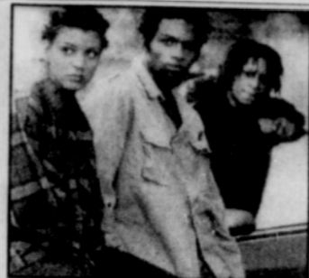
See Entertainment, page B5.

Blowout Comb is the latest album out from the Digable Planets.