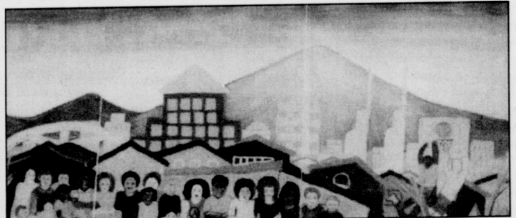
Against a backdrop of blue skies and mountains, the new mural at the Garlington Center depicts Portland landmark skyscrapers, with a multi-ethnic group, symbolizing diversity.