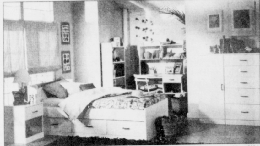
This ready-to-assemble computer desk and bookcase from Sauder Woodworking creates a good working environment.

A bookcase or desk with hutch provides accessible storage for reference resources to help children solve problems on their own — with-