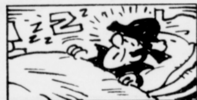
Napoleon was a well-known insomniac and had to get by on three or four hours of sleep a night.