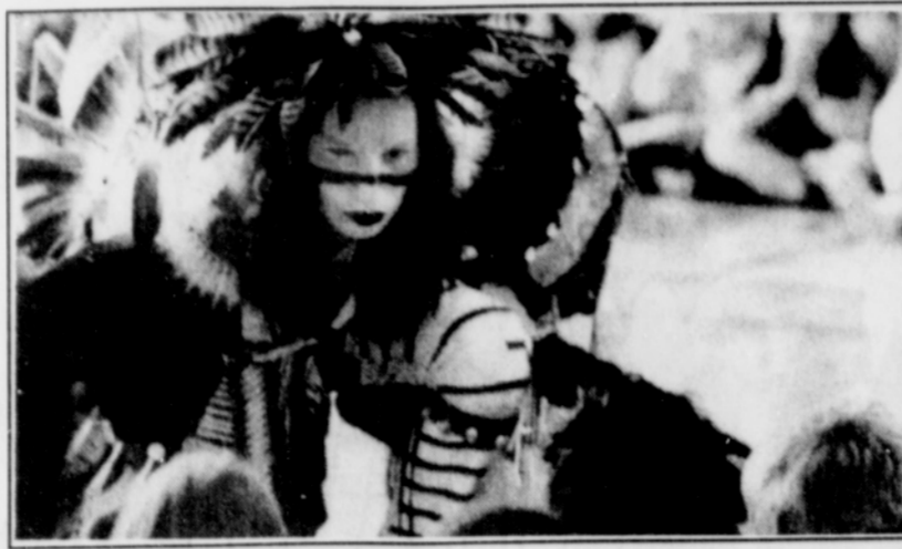
The group Young Audiences brings arts to Portland area children.

The target date for re-opening the waiting list is set for March 20, 1995.