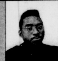
By Promise King

For across America stands distinct rest of the human