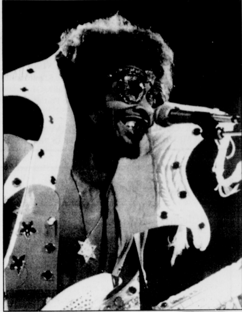
The man with the sunglasses and the platforms is back, and he's gonna tear the roof off the sucker again, with two hours of loopy, slammin', blaster-powered Space Funk!!!

Bangin On Wax is a hard core gangsta rap album.