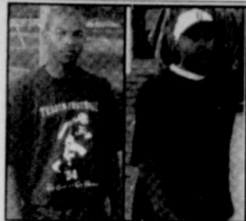
See Sports, page B2.

One is the quarterback at Wilson High, the other leads the Jefferson Democrats.