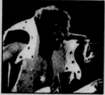
See Entertainment, page B3.

Entertainer Bootsy Collins and his rubber band will perform in Portland.