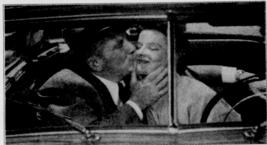
Spencer Tracy and Katharine Hepburn in "Adam's Rib"

Modern day roles have you confused? The battle of the sexes putting a strain on your relationship? Try bringing home dinner from Wacky Czaba's! Their barbecue is guaranteed to make you agree on at least one thing, the food's great! Whether its ribs, chicken, blackeyed peas or sweet potato pie, you'll be satisfied. As for the difference between the sexes "Vive la différence!"