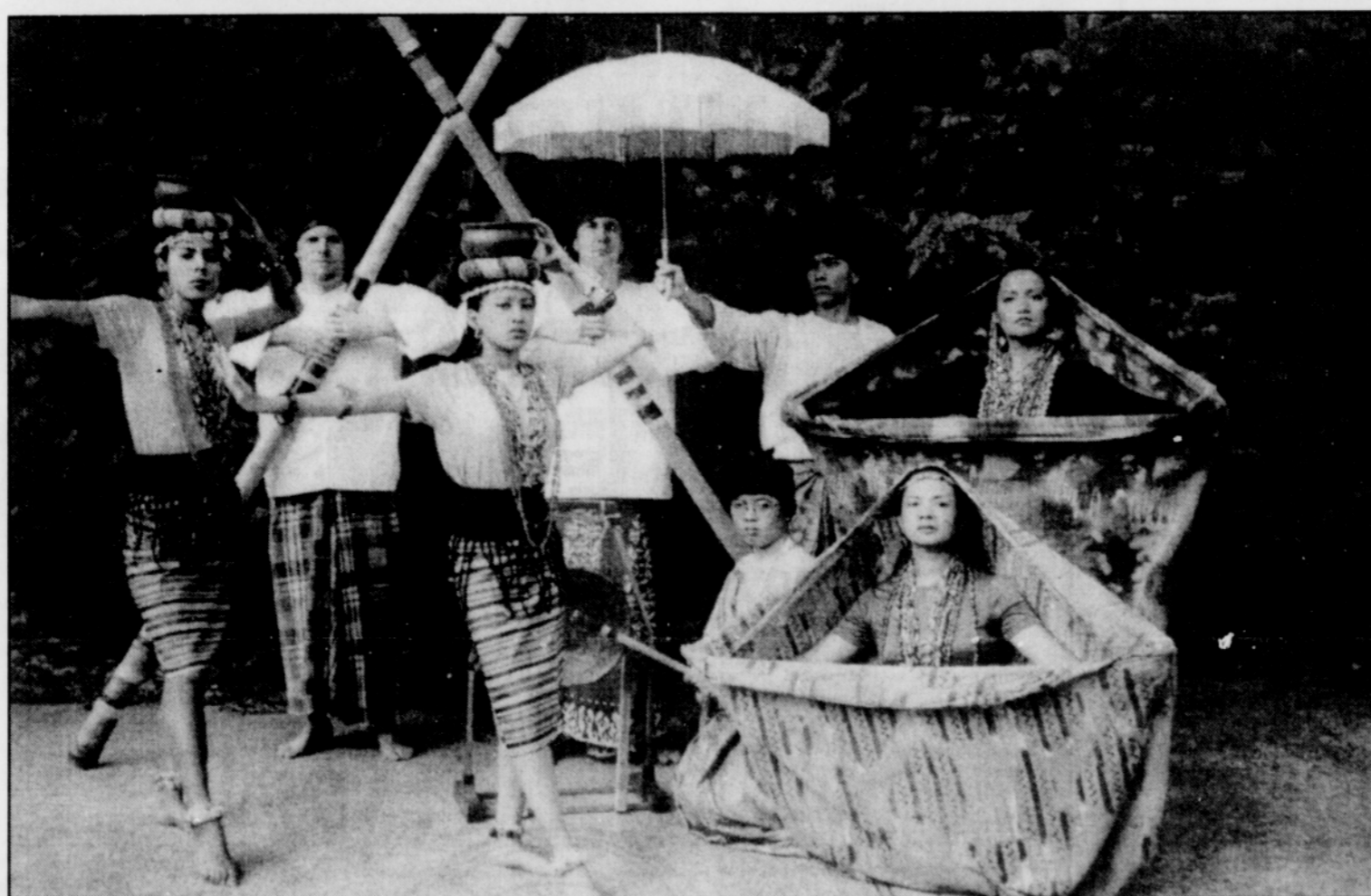
Filipino dance by Teatro Bagong Silangan will be just some of the entertainment during Interstate Firehouse Cultural Center's Passport to Different Worlds, the fourth annual fundraiser for the non-profit community arts organization.

A stage of international dance and music will light up community spirit as the Interstate Firehouse Cultural Center presents a fundraising party, "IFCC Passport to Different Worlds."