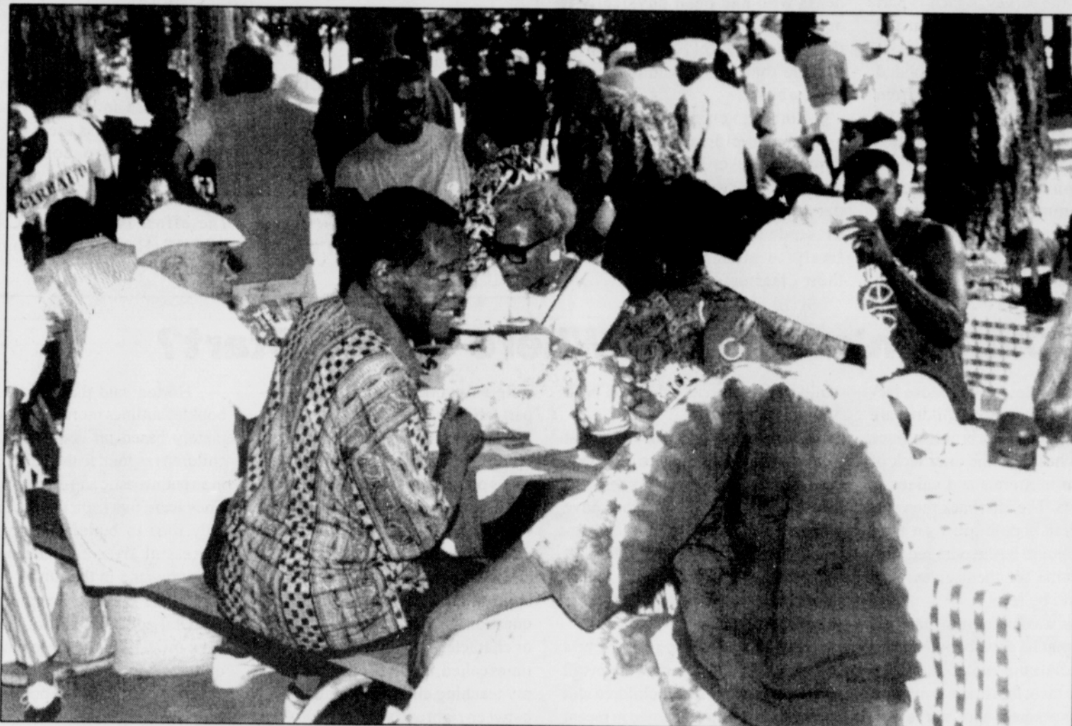
Old and new friends and neighbors of North and Northeast Portland and visitors alike found the food and comradery of 'The Gathering' picnic at Columbia Park just to their liking.

You can meet "Art the Cultural Bus," a new resource to the Portland area, during Artquake, Sept. 3-5. The bus will offer information on cultural attractions in the Portland/Vancouver area. Funding for the bus was made possible by the Northwest Business Committee for the Arts, the Metropolitan Arts Commission, Tri-Met and Metro regional government.