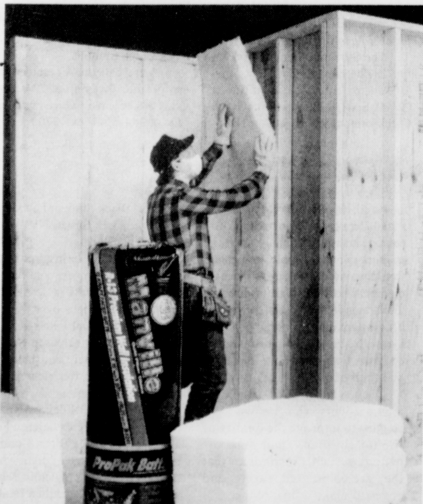
Manville brand ProPak™ Batts insulation saves homeowners time.

Save time on remodeling projects by handling them the way the pros do.