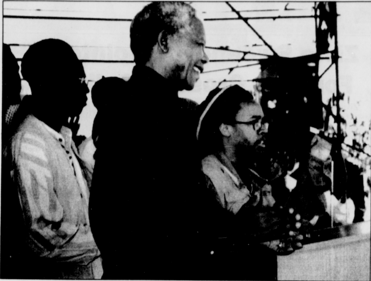
A United Front Of Consciousness as Arrested Development Release Their Second Single

"I call on the red, and the black and the green... United we stand united we fall"