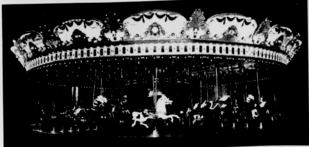
The Merry-Go-Round at Jantzen Beach Shopping Center