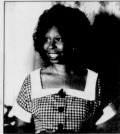
Whoopi Goldberg as Corrina