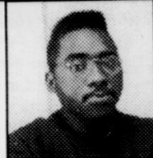
by Promise King

Rwanda's self-masacred self-destruction is resurgence of ethnic hatred that European colonial lords left in the soil and soul of various African countries through insensitive and hypocritical posture and fraudulent play on Africa's ethnic make up. This ethnic manipulation has resulted into tribal violence and ethnic squabble.