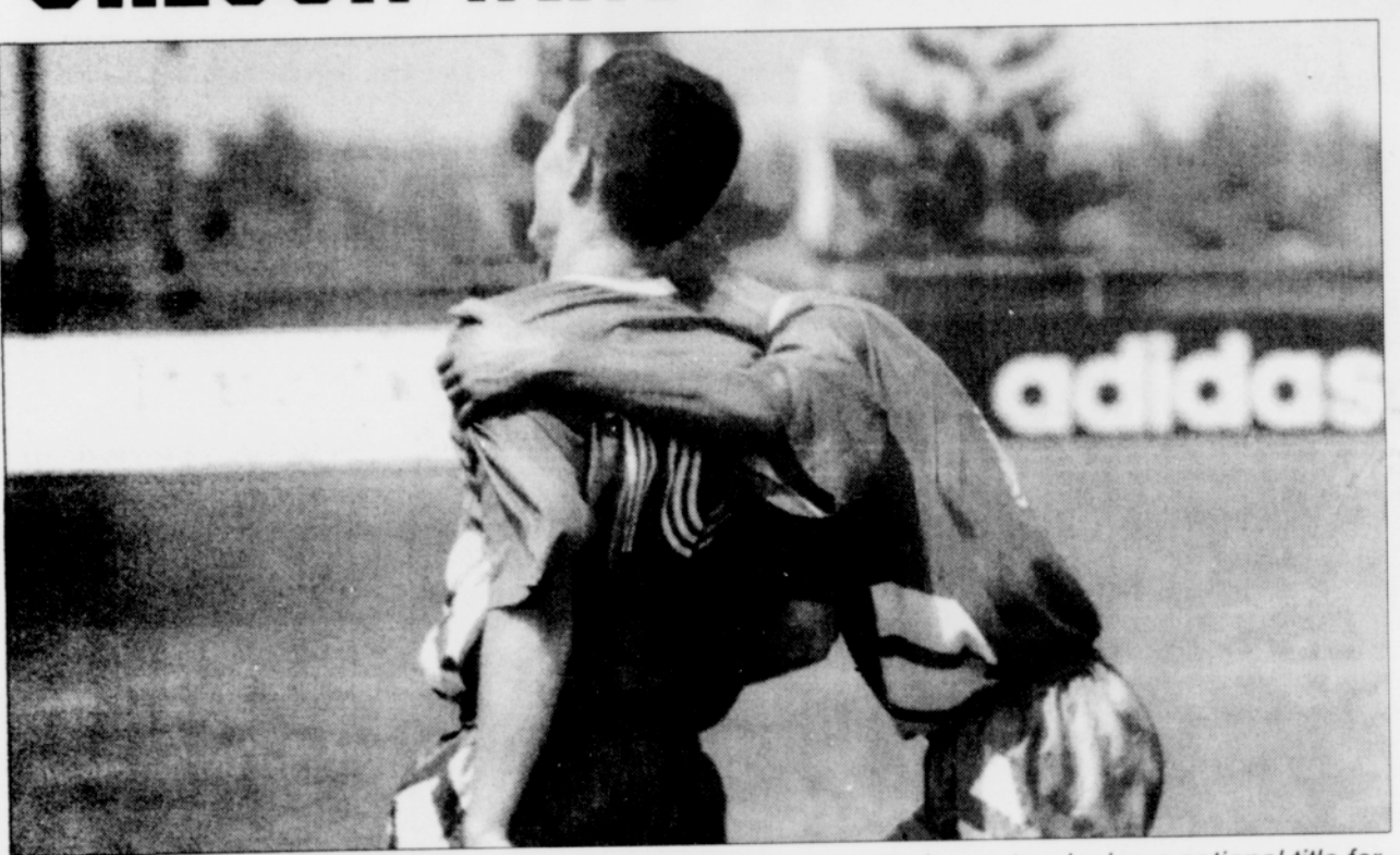
Players on the F.C. Portland team find a moment to celebrate on their way to winning a national title for boys youth soccer under 18.