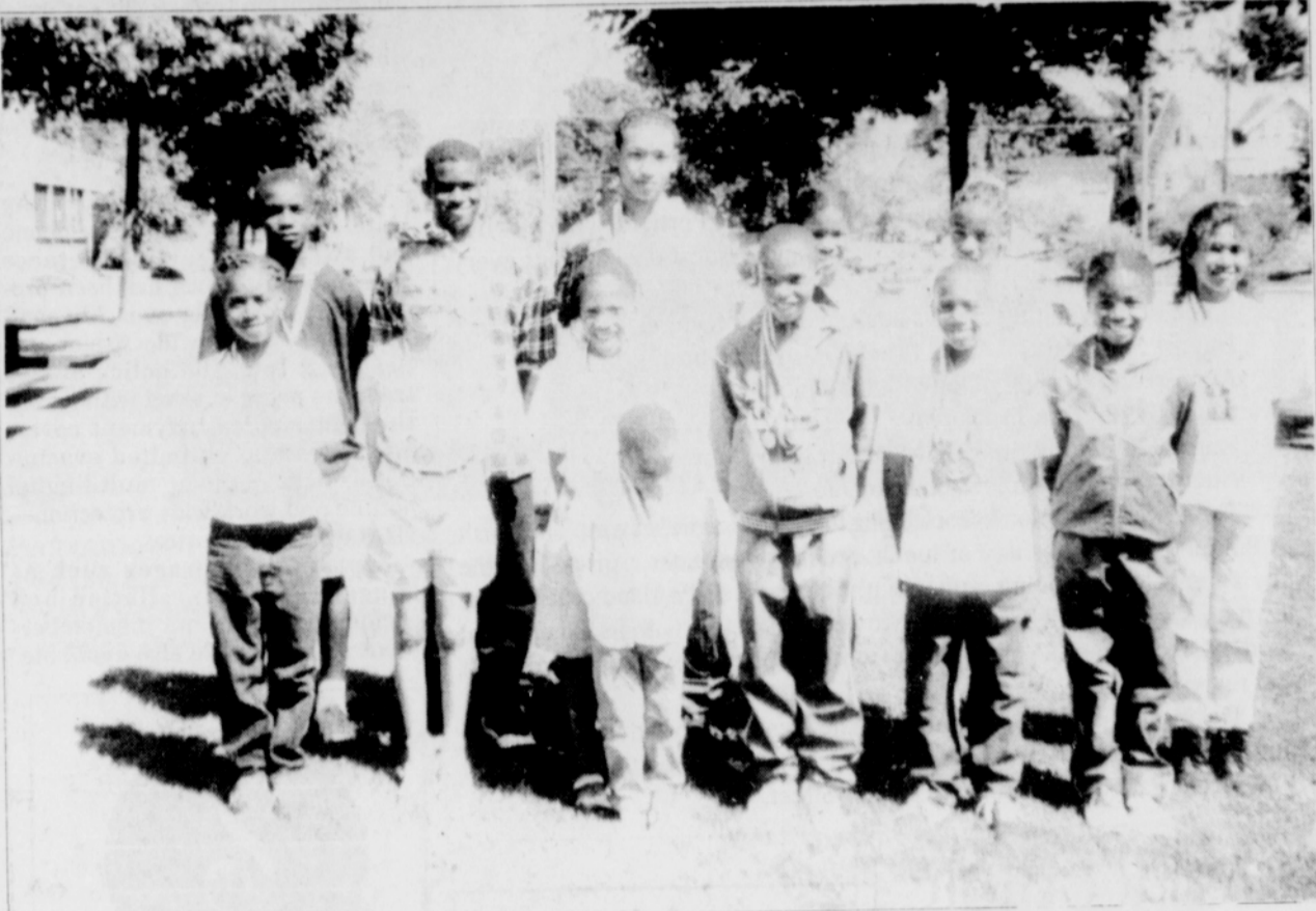
Members of the Northeast Community Tracksters who qualified for USA Junior Olympic Track and Field events. The club is headed to the national competition held this week in Gainesville, Fla.