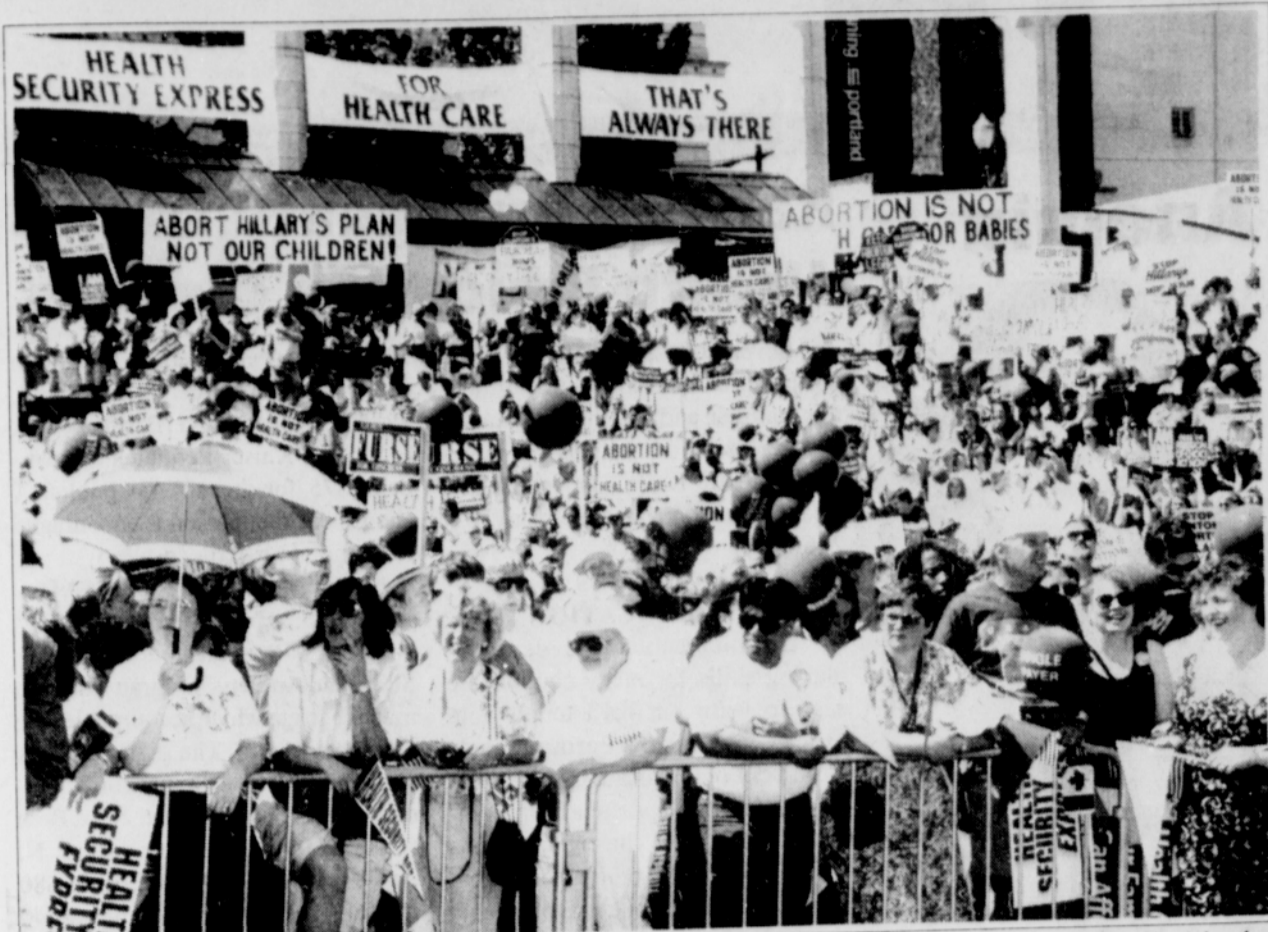
More than a thousand area residents gathered Friday at Pioneer Courthouse Square to hear First Lady Hillary Rodham Clinton call for passage of health care legislation.