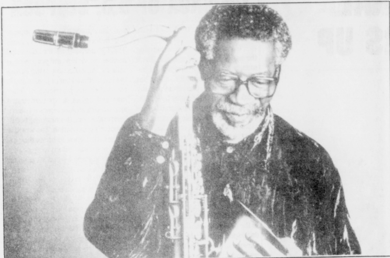
Joe Henderson, Billboard's number one jazz artist of 1993, will open the Mt. Hood Festival of Jazz on Saturday, Aug. 6. Tickets for the festival are available through Ticketmaster outlets or by calling (503) 224-4400.