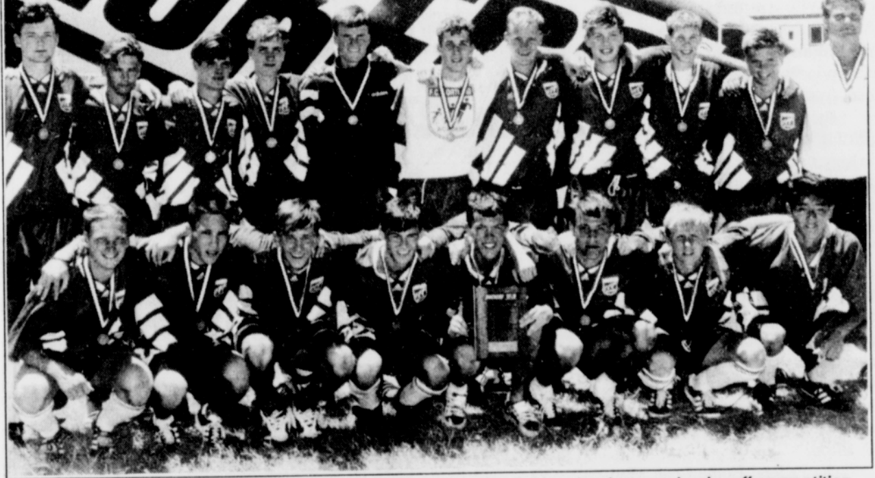
The Hillsboro Football Club is finding success on the soccer field as it advances in playoff competition.

The Hillsboro Football Club, Portland's under 18 boys soccer team demonstrated their hunger to win as they advanced to the National Championship, the premier youth soccer tournament in the United States.