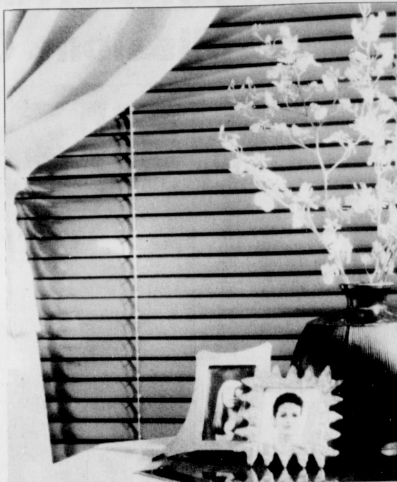
The Light Garde mini-blind is a revolutionary new product by Del Mar Window Coverings that is the industry's first significantly room-darkening mini-blind.